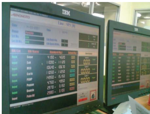
Main Control room (all data is networked to central server)

Once mixed, the final product is gravity fed to the bottom floor into stainless SUS#316 storage bins which have wheels locked onto customised track scales. This enables the bins to be weighed and filled to a preset level while still being mobile.